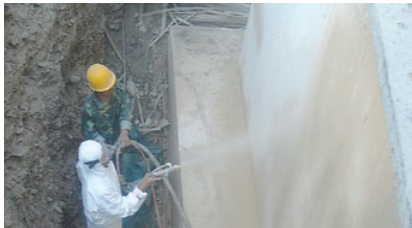
Coating concrete foundations