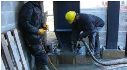
Filling steel columns in a car park