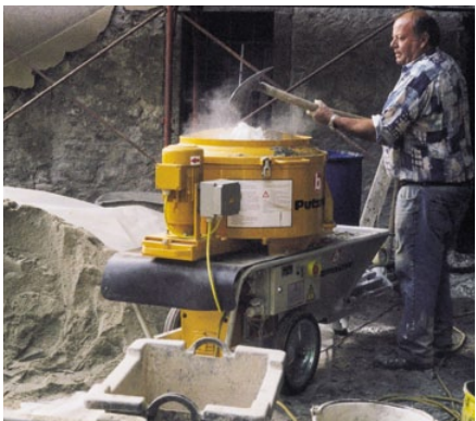
Filling the S 5 EVTM with a shovel