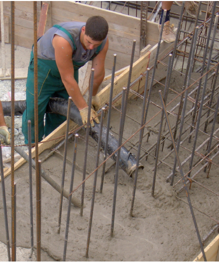
The P 718 conveys fine concrete up to a grain size of 32 mm, among other things.

This makes the P 718 an unbelievably versatile fine concrete pump that can be used when space is limited on the construction site.