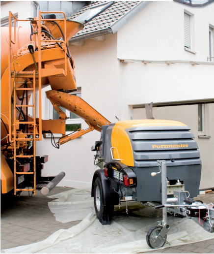
Truck mixers have ideal access to the large hopper.